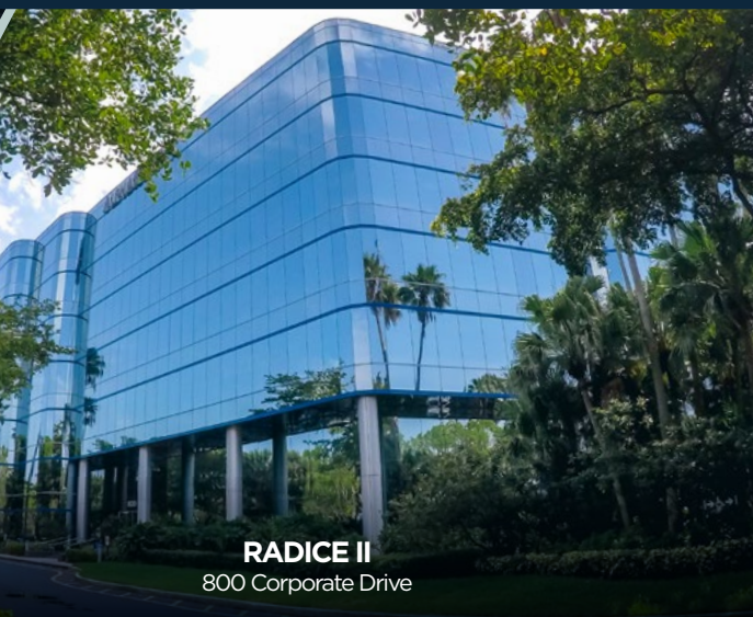
RADICE II 800 Corporate Drive