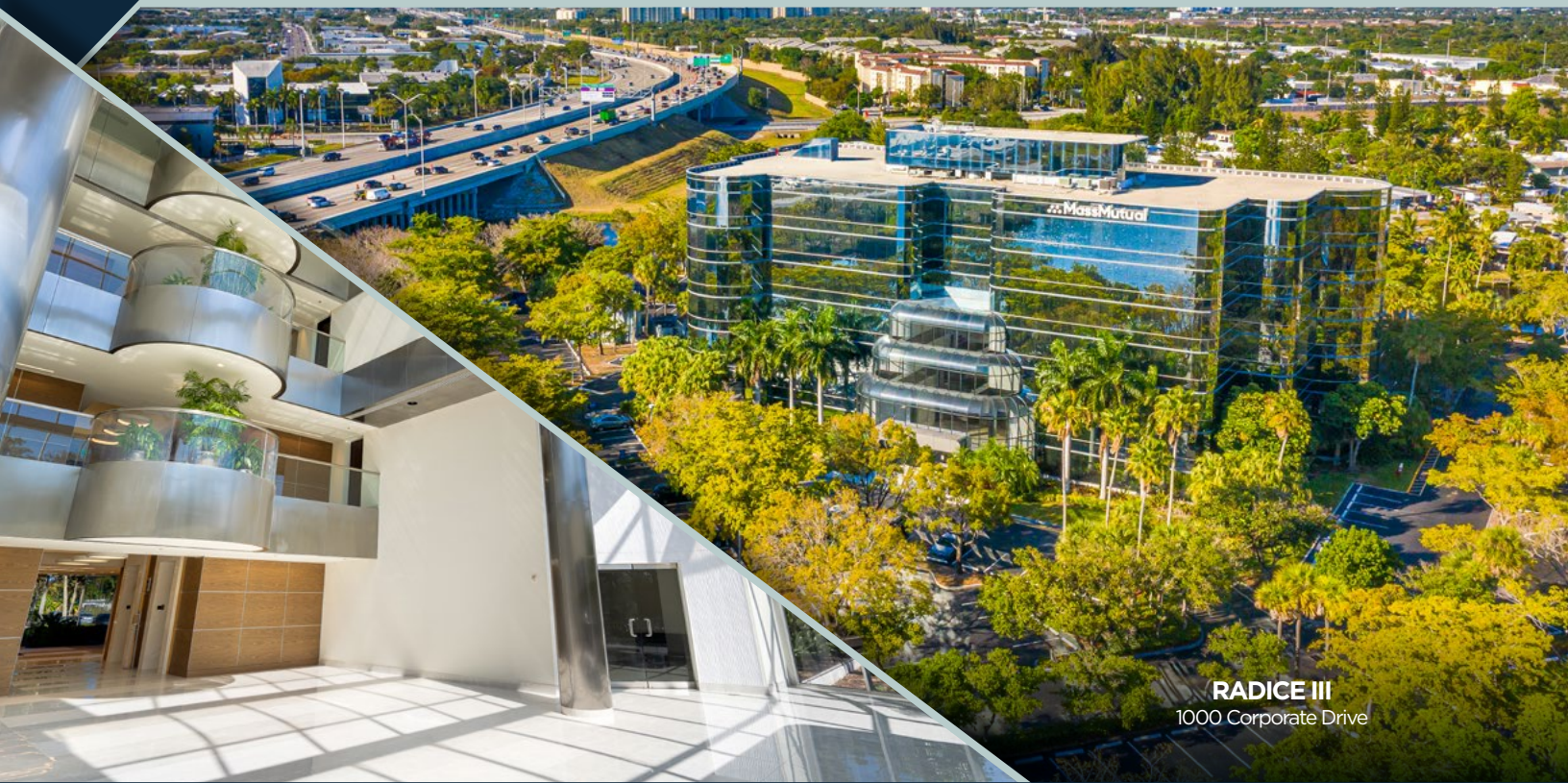
RADICE III 1000 Corporate Drive