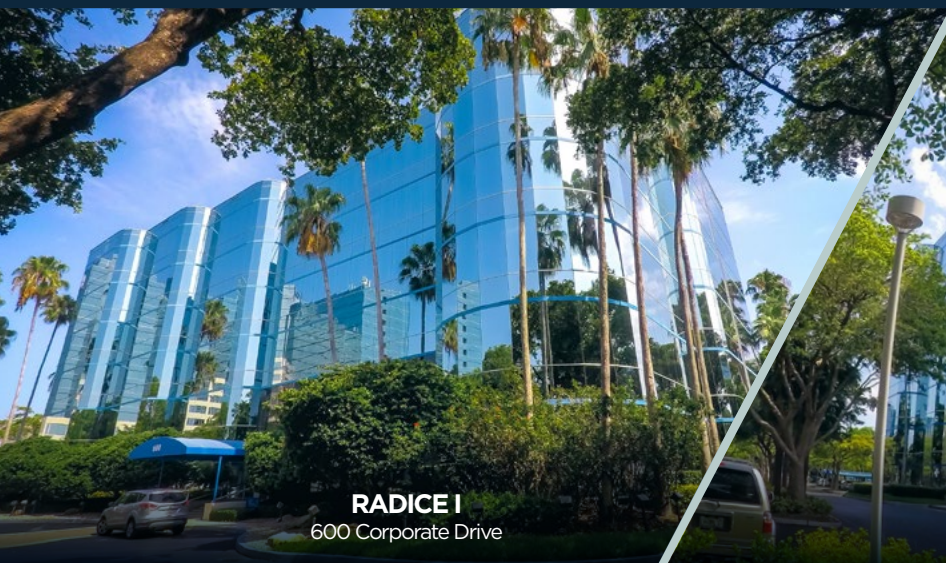
RADICE I 600 Corporate Drive