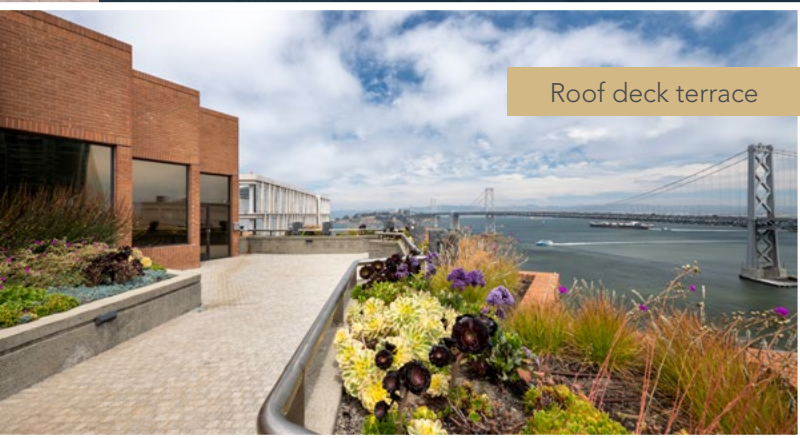
Roof deck terrace