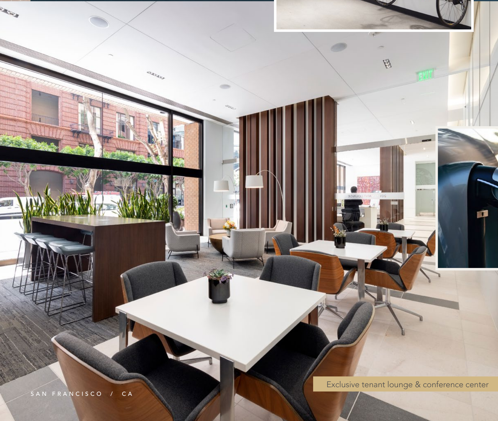
Exclusive tenant lounge & conference center