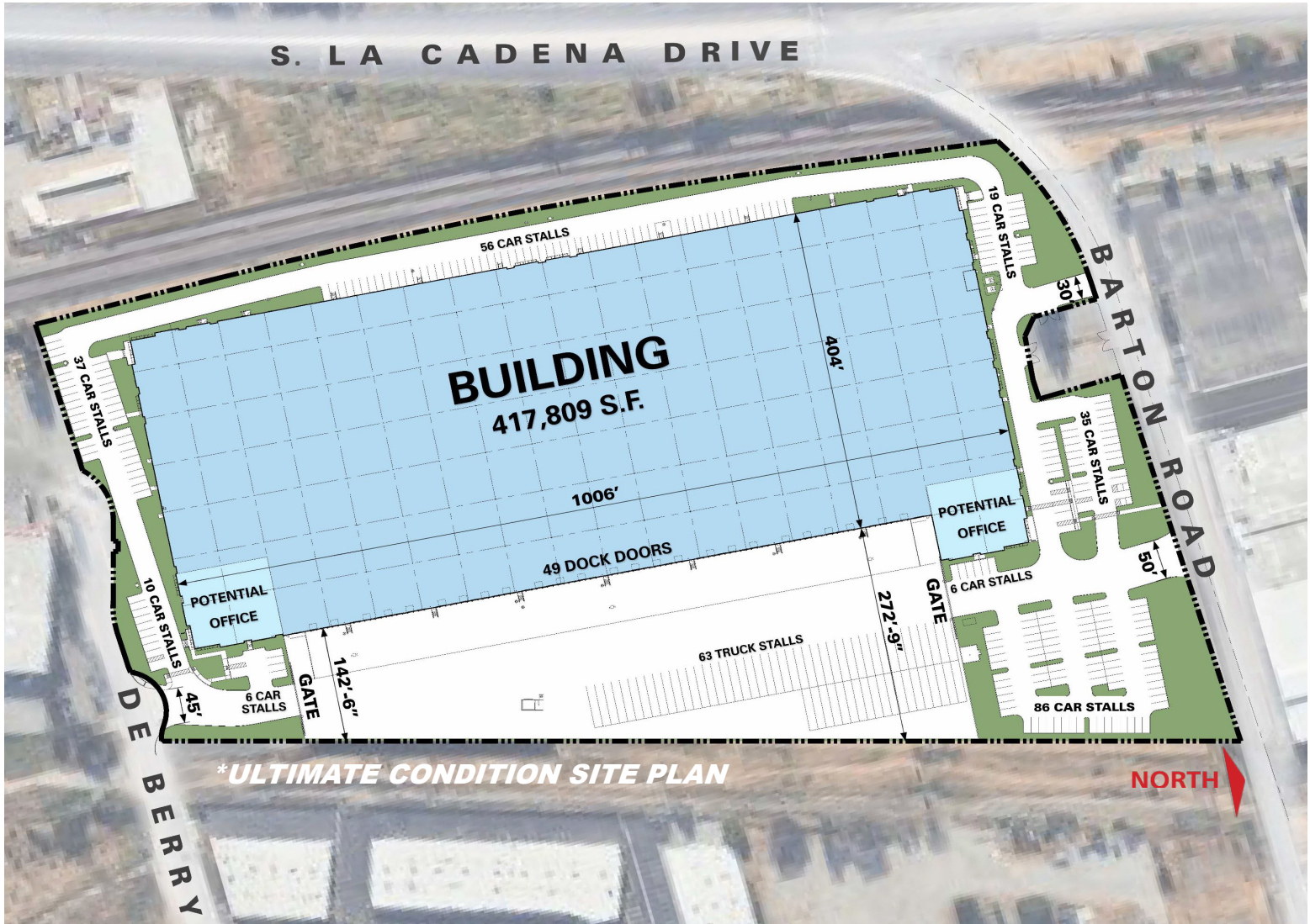
*ULTIMATE CONDITION SITE PLAN

*In 2027, the City of Colton, in cooperation with the City of Grand Terrace and CalDOT, will be removing the existing Barton Road elevated roadway (bridge) to the immediate east of the Barton Road Logistics Center project ("Project") and replacing with new lowered and widened roadway improvements. During this approximate 10-month time frame, Barton Road will be closed to through traffic and all commercial trucks traveling to/from the Project will be required to utilize La Crosse Avenue and De Berry for ingress and egress.