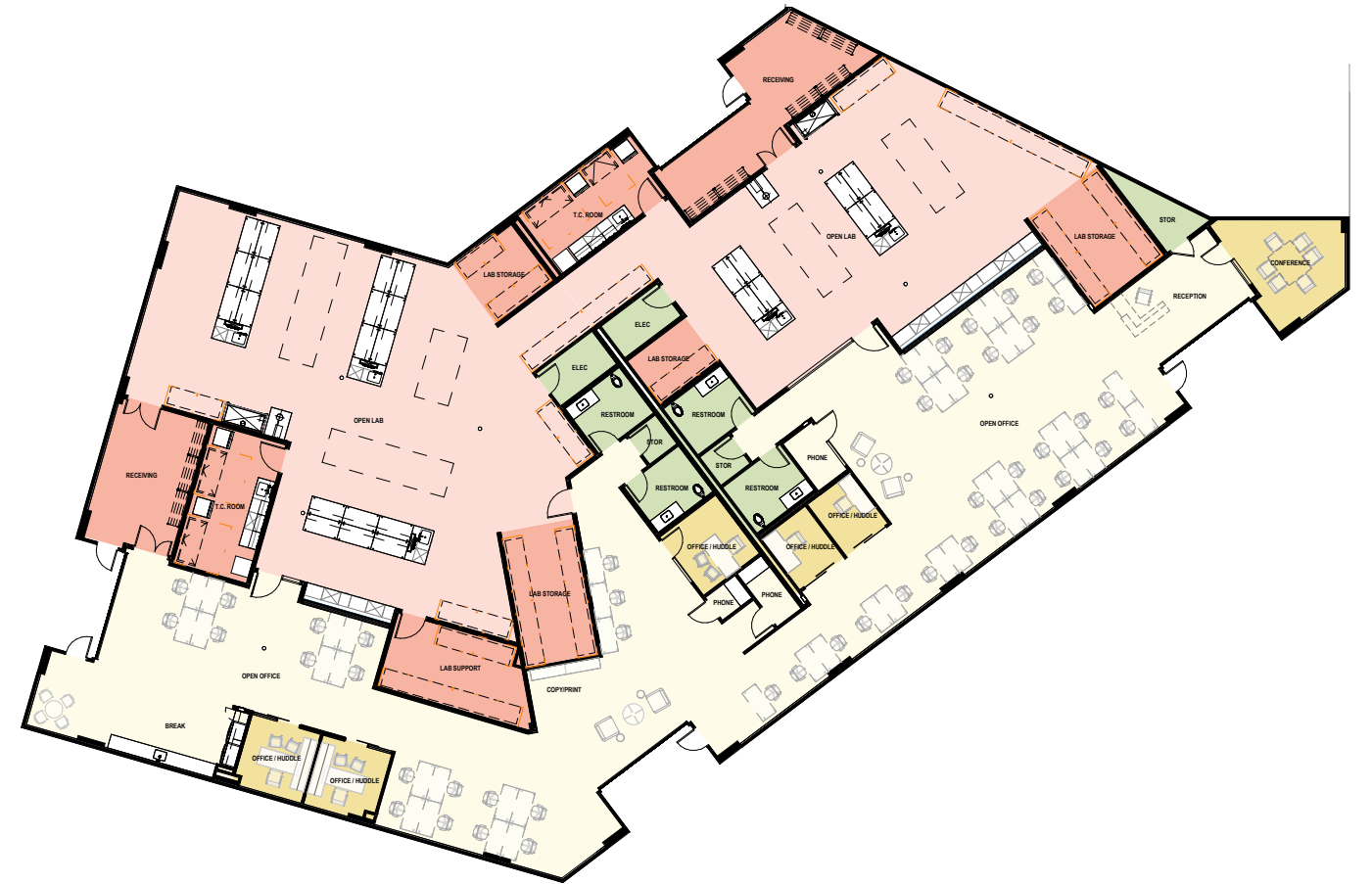
SUITE 6 15,249 SF