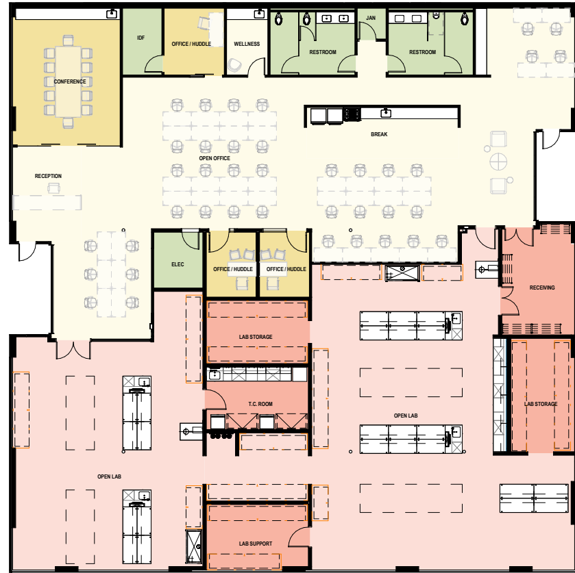
SUITE 1 11,803 SF