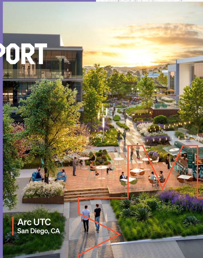
Arc UTC San Diego, CA