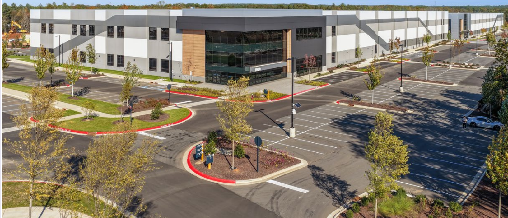
Pathway Triangle Morrisville, NC