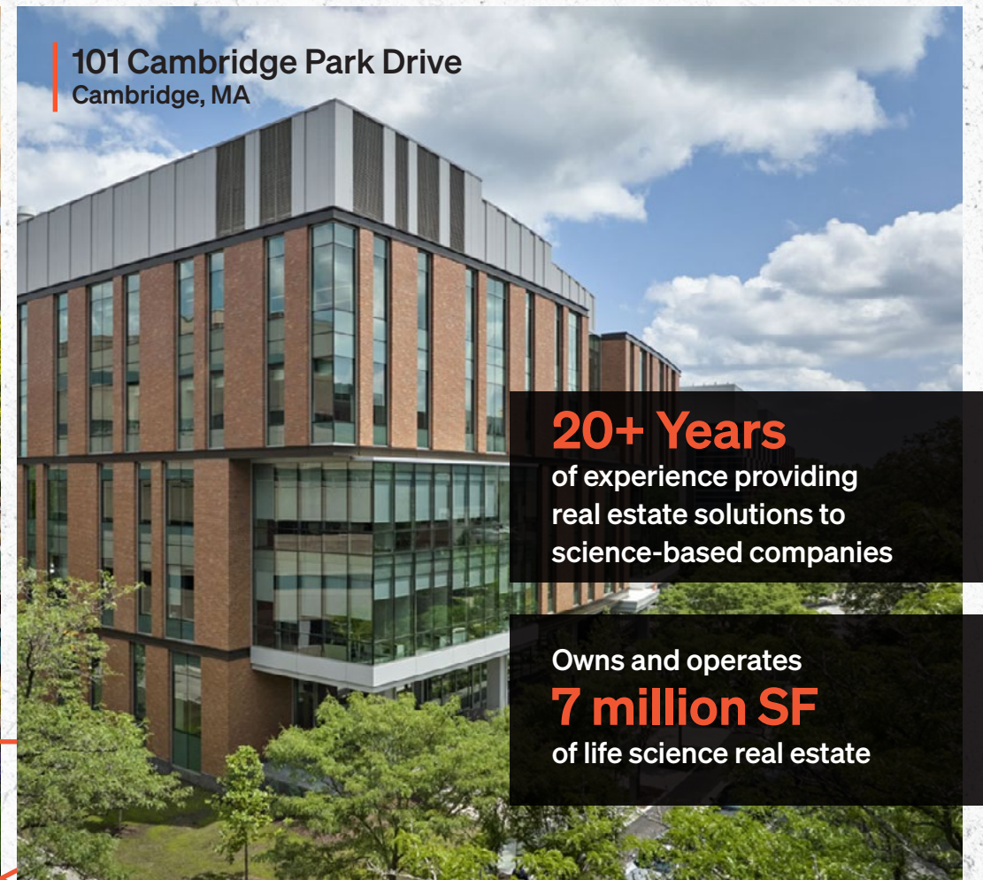
101 Cambridge Park Drive Cambridge, MA

20+ Years of experience providing real estate solutions to science-based companies