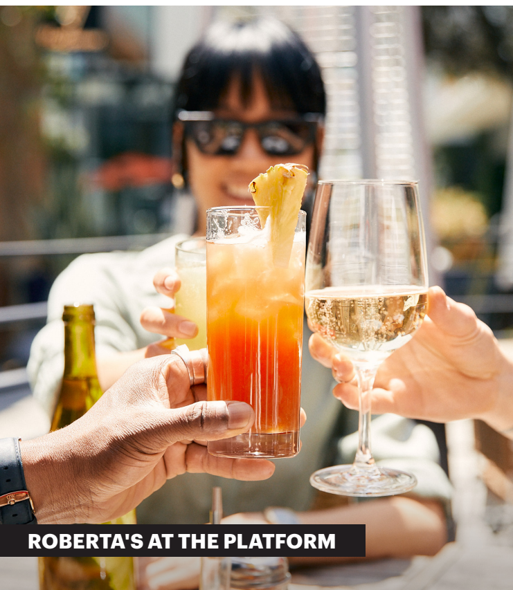
ROBERTA'S AT THE PLATFORM