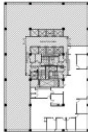
KEY PLAN NTS