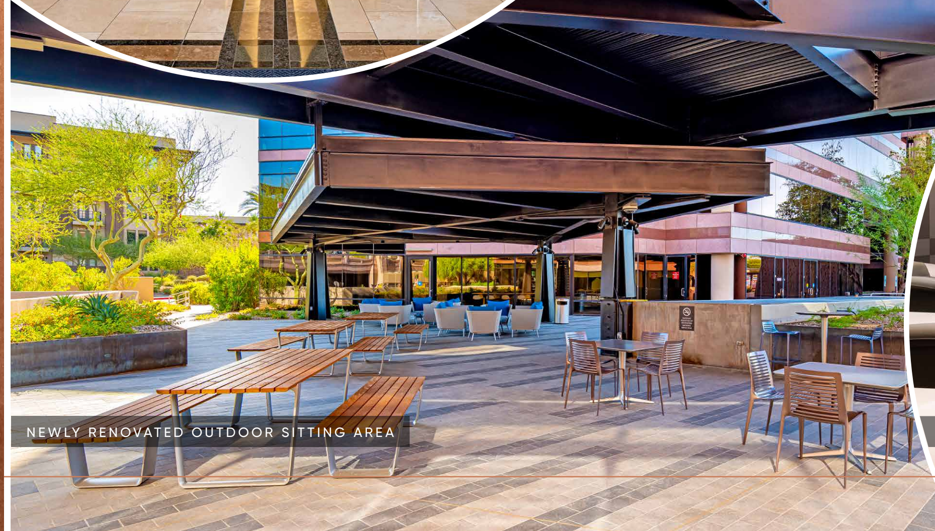
NEWLY RENOVATED OUTDOOR SITTING AREA