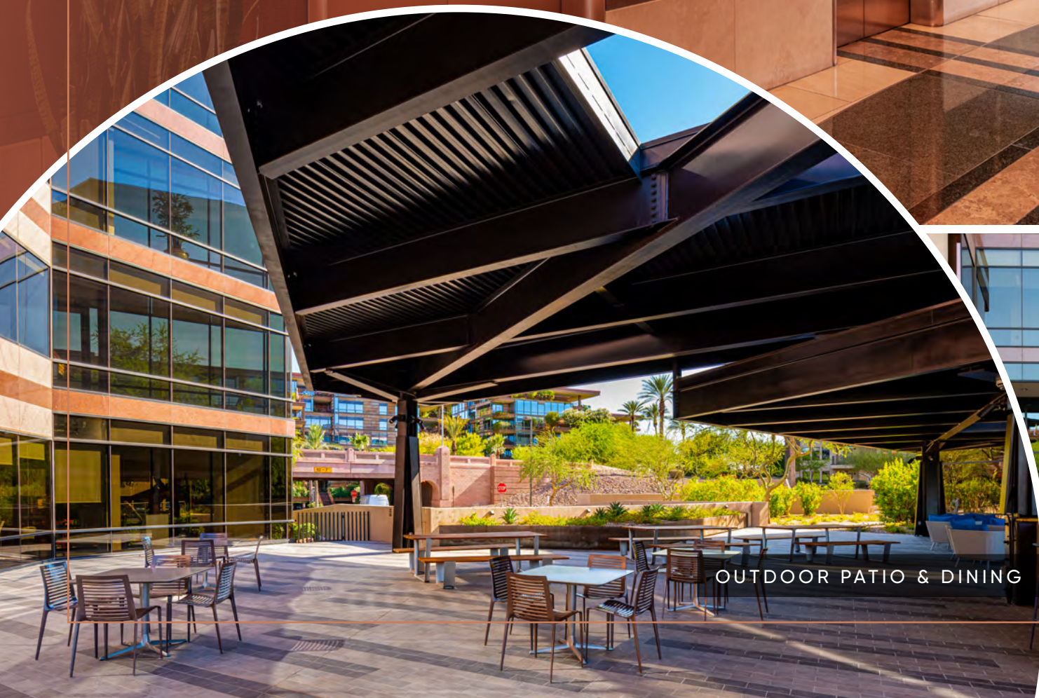
OUTDOOR PATIO & DINING