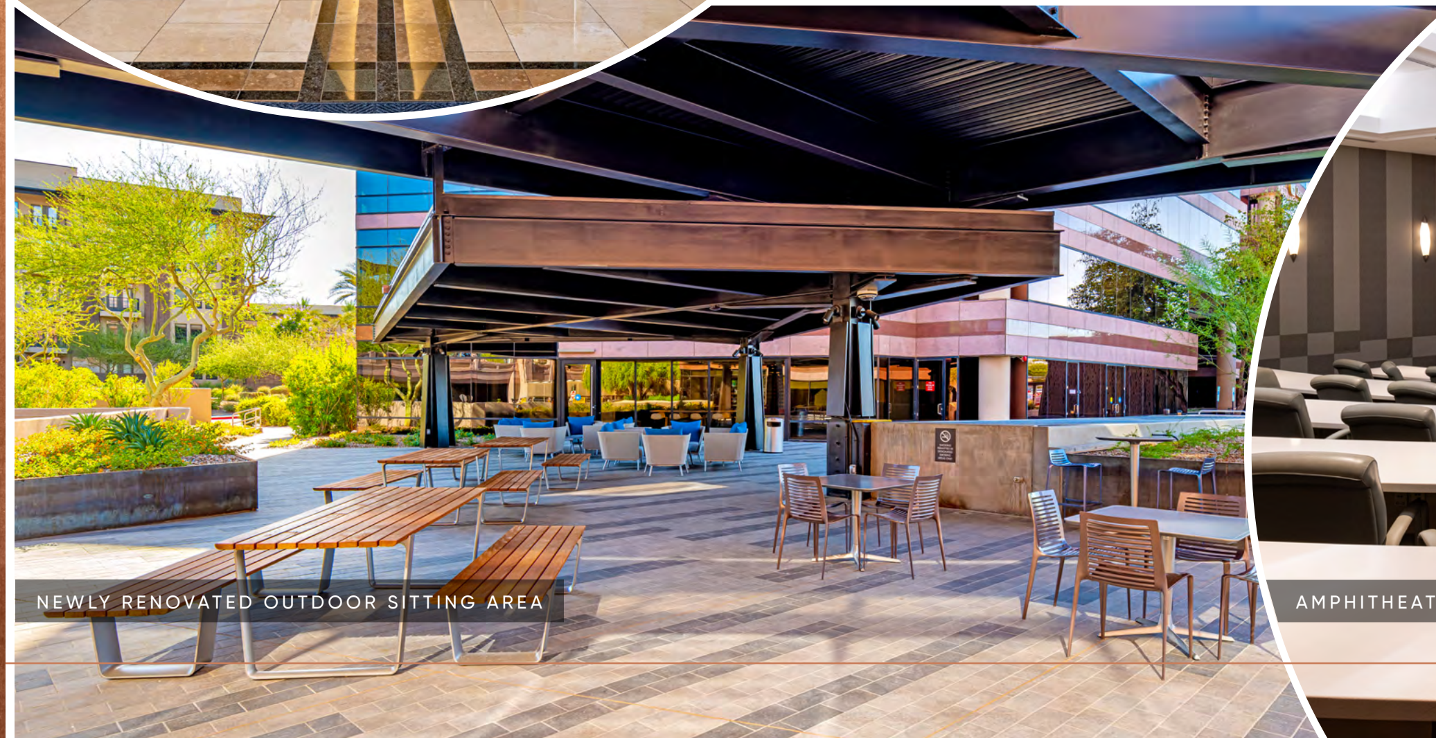
NEWLY RENOVATED OUTDOOR SITTING AREA