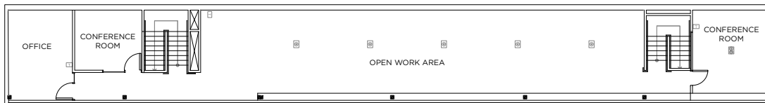
MEZZANINE FLOOR PLAN