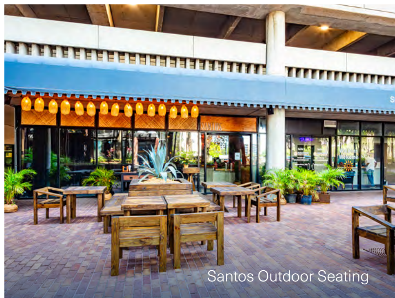
Santos Outdoor Seating