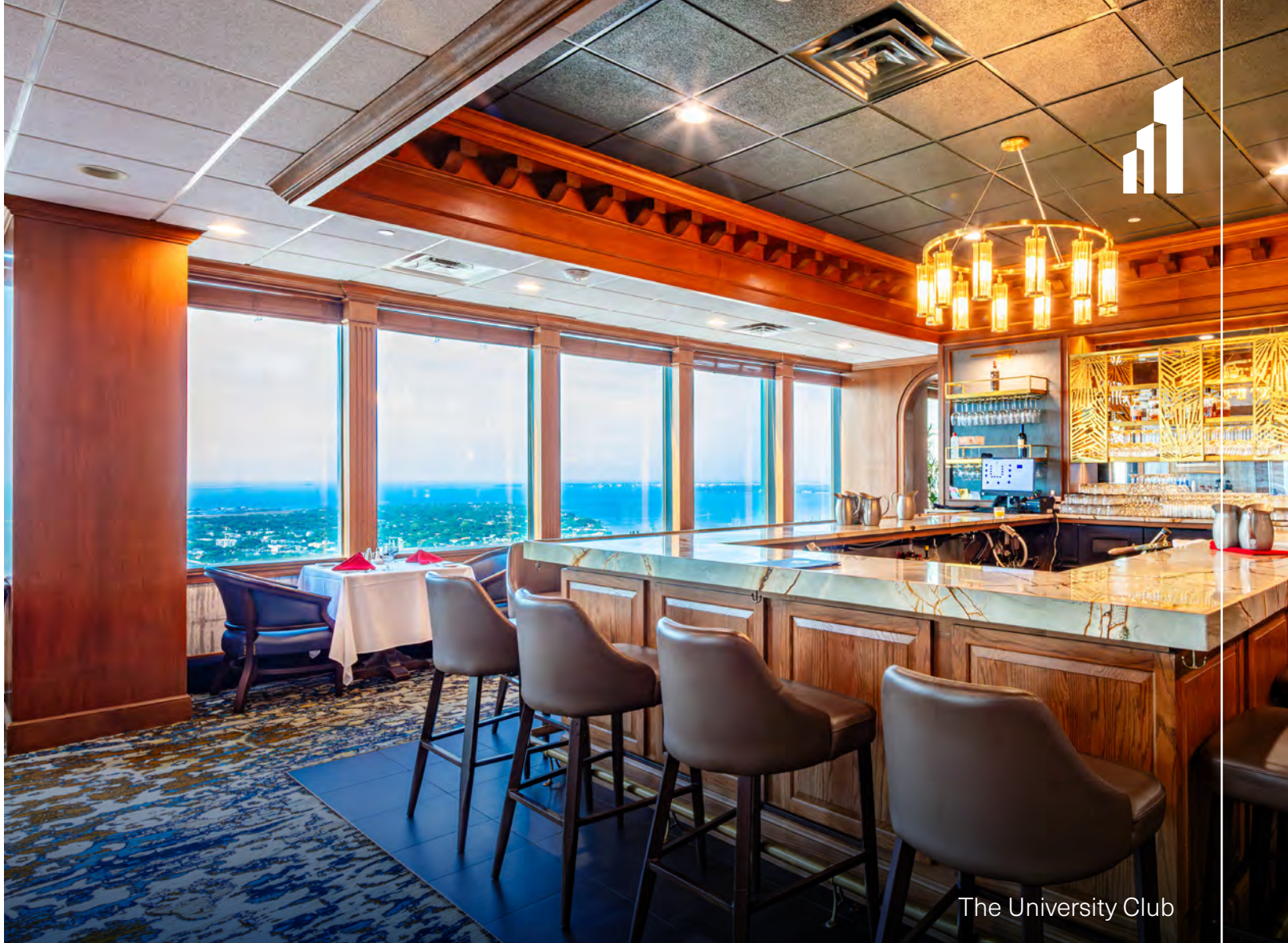
The University Club