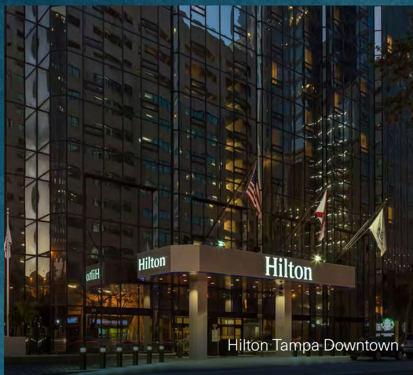
Hilton Tampa Downtown

Connected by covered skybridge, Tampa City Center offers unparalleled access to the hospitality of Hilton Downtown Tampa. Whether hosting out-of-town visitors, taking clients out to lunch or holding large events, the Hilton provides tenants with seamless accommodations.