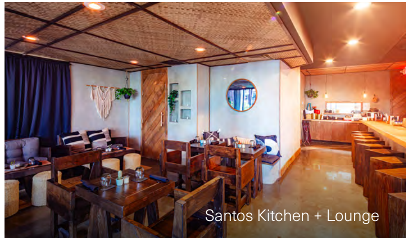
Santos Kitchen + Lounge