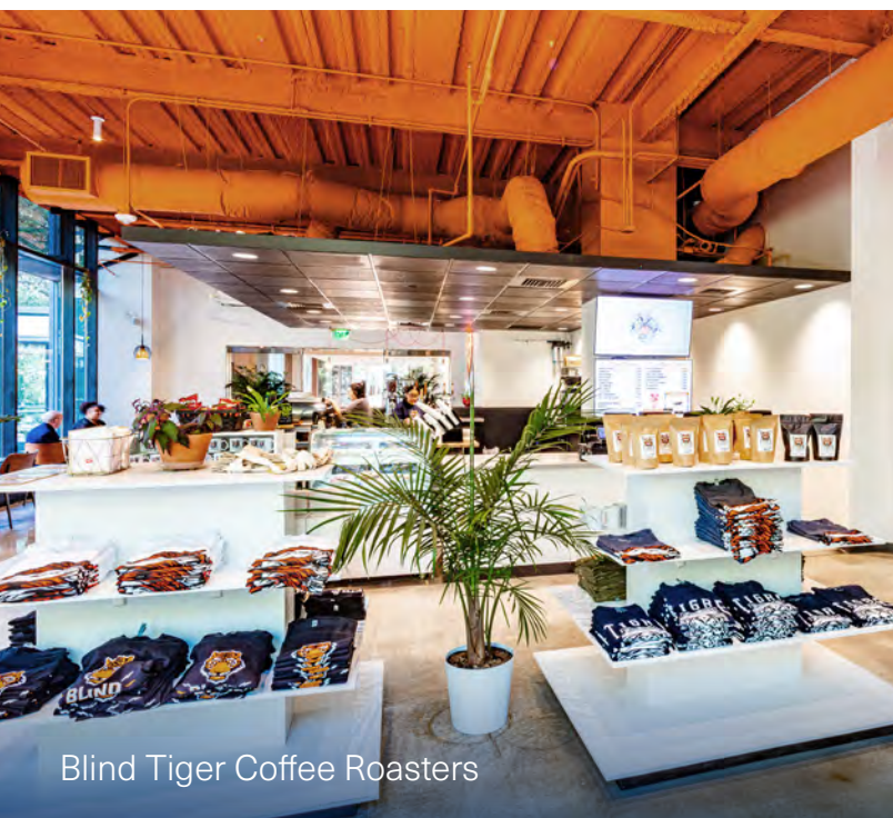
Blind Tiger Coffee Roasters